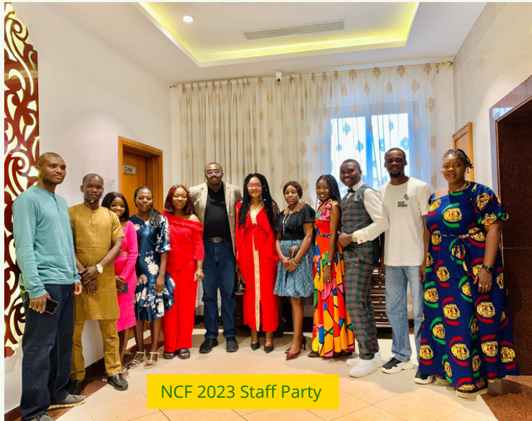
NCF 2023 Staff Party