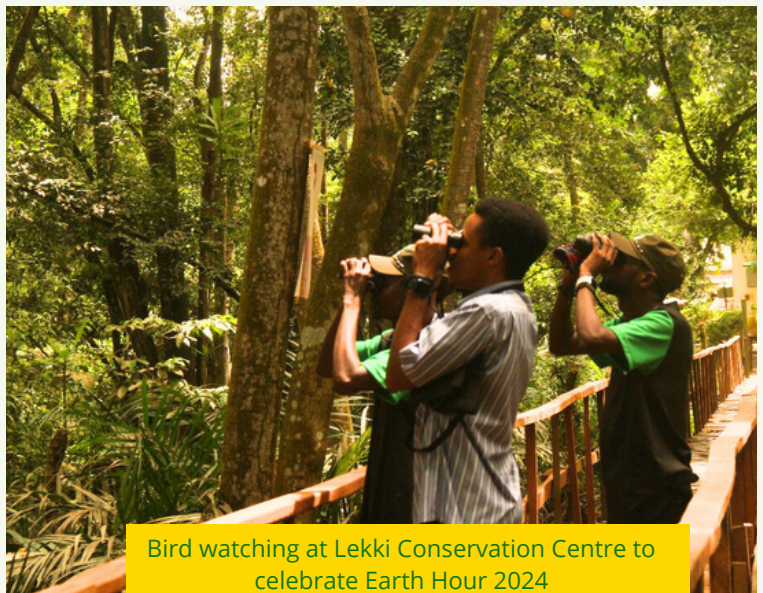
Bird watching at Lekki Conservation Centre to celebrate Earth Hour 2024