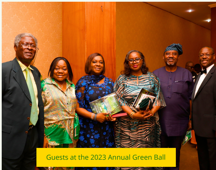
Guests at the 2023 Annual Green Ball