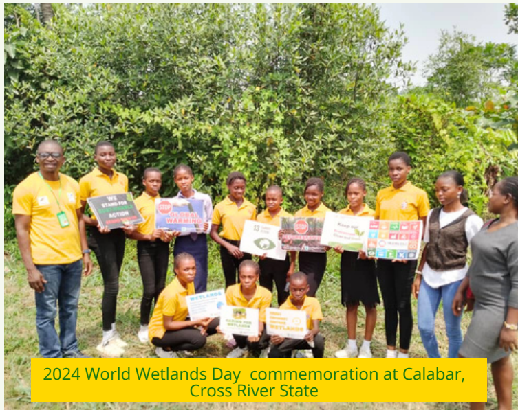
2024 World Wetlands Day commemoration at Calabar, Cross River State