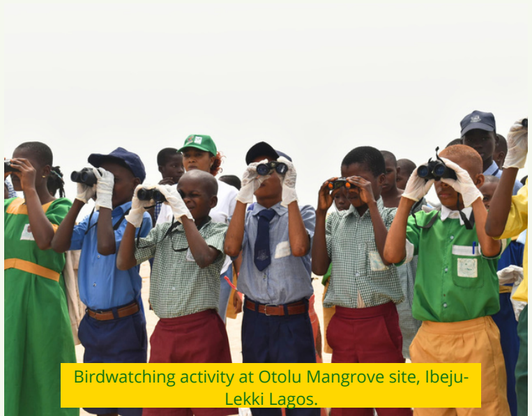
Birdwatching activity at Otolu Mangrove site, Ibeju-Lekki Lagos.