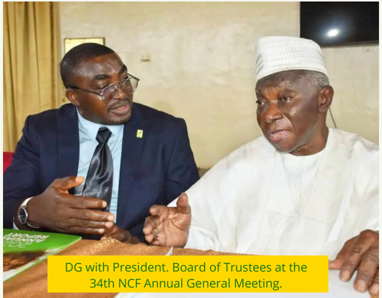
DG with President, Board of Trustees at the 34th NCF Annual General Meeting.