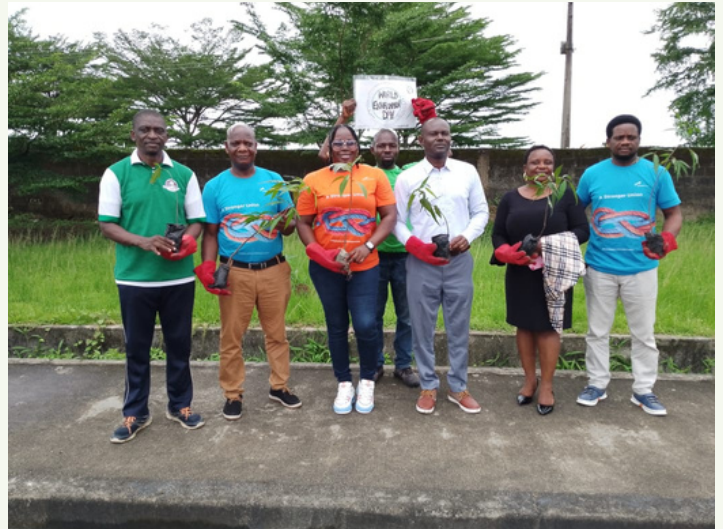
WED 2024 Commemoration in Calabar