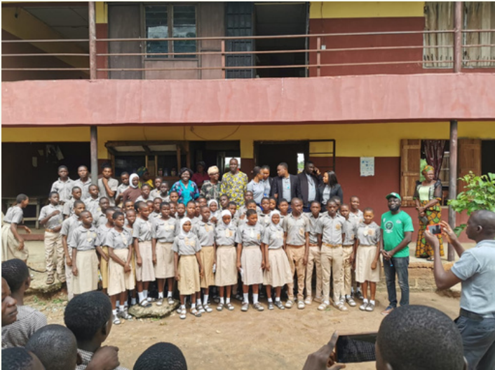
Tree Planting at Obanta comprehensive High School