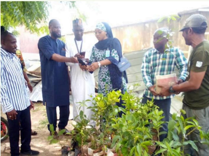
Commemorative planting at Nguru, Yobe

As the world continues to battle the effects of land degradation and desertification, Nigeria is not being left out of the trouble. This year's World Environment Day highlights pressing environmental issues that need urgent attention. Several days of activities were planned to educate people and propose practical solutions to deforestation through simple and adaptable nature-based strategies.